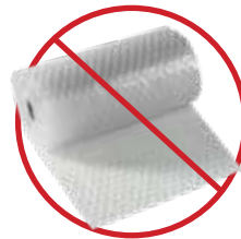
Replacement of plastic Air Bubble sheet

Honeycomb, is a very good eco-friendly product that replaces typical air bubble film made of plastic. It is lightweight material that has excellent compatibility with other materials and an excellent strength-to-weight ratio. It is also more economical packaging material, thereby making it an ideal choice, as honeycomb products are made from recyclable, biodegradable and bio compostable paper.