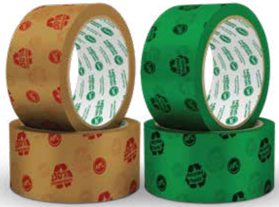
Film of RC100 is ISCC Certified